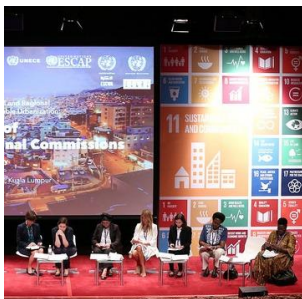
33 ONE UN events