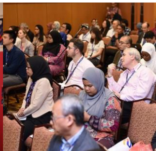
168 Side events