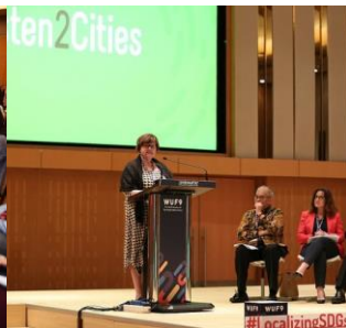
30 Listen to cities events