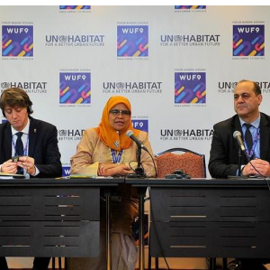
17 Press Conferences