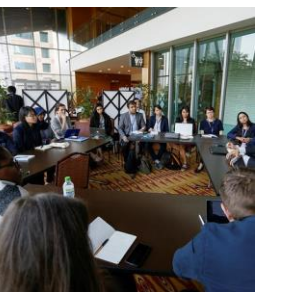
1 Urban Journalism Academy