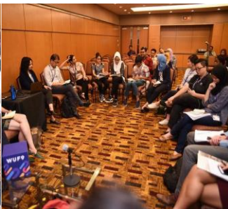
60 Training events