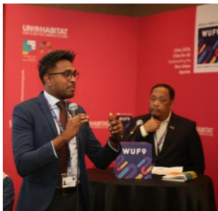
143 Networking events