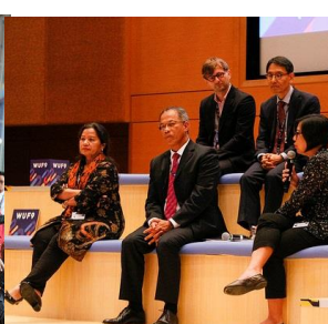
15 Stakeholders Roundtables