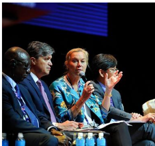
6 High-level Roundtables