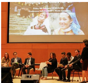
21 Special Sessions