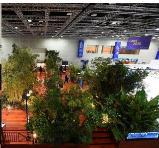
93 Exhibition Booths