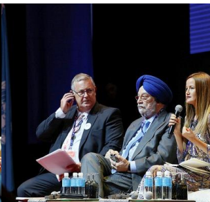
1 Ministers Roundtable