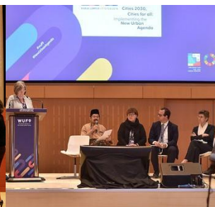
10 Plenary Meetings