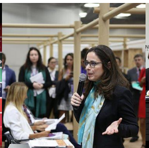
33 Launch of publications