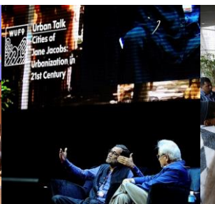
3 Urban Talks